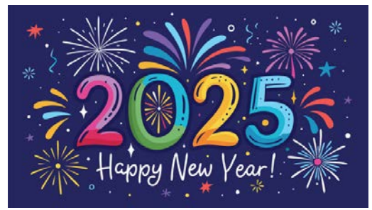
from the Recreation Services Team!