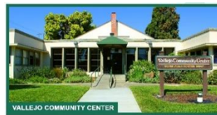
Vallejo Community Center 225 Amador Street Vallejo, CA 94590