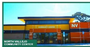
North Vallejo Community Center 1121 Whitney Avenue Vallejo, CA 94589