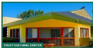
Foley Cultural Center 1499 N. Camino Alto Vallejo, CA 94589

Instructors may arrive fifteen (15) minutes prior to the class’s start time, unless otherwise arranged with the GVRD Recreation Coordinator. Instructors are responsible for setting up and taking down the equipment needed for the class and cleaning up the room used. GVRD does not provide storage for Instructor’s equipment or supplies.